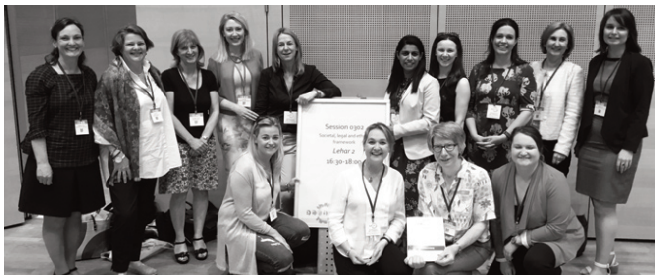
Photo: Most of the Irish contingent at the European Conference for Rare Disease, Vienna 2018. The group includes many rare disease research advocates, including representatives from the Rare Disease Office, Cystinosis Ireland, Rare Diseases Ireland, Retina International, 22q11 Ireland, RAinDRoP, Fighting Blindness, HRCI, PTC Therapeutics, the National Clinical Programme for Rare Diseases, DEBRA Ireland, Friedrich's Ataxia Research Alliance Ireland and Muscular Dystrophy Ireland.

As we look to the future, more will be required to create formal and resourced rare disease research networks in Ireland and to facilitate our increased involvement in international networks. It is also important that we focus on research as a critical part of the solution for improved rare disease care, rather than treating it as a separate and less urgent endeavour.